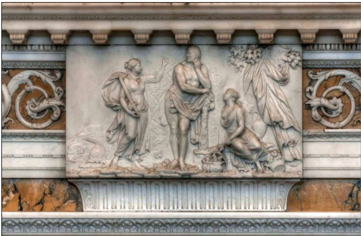
Fig. 1: Choice of Hercules chimneypiece panel, Carter Workshop, late eighteenth century, Adam Room, Grove House, University of Roehampton