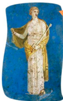
Fresk z Willi Ariadny w Stabie, przedstawiający prawdopodobnie Medę, odkryty w 1759 r., I w. n.e., autor nieznan, obecnie w Museo Archeologico Nazionale w Neapolu (Włochy)