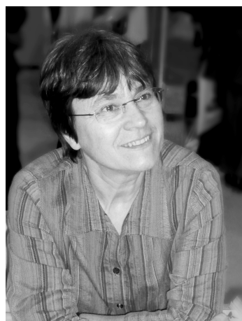
Portrait, courtesy of Univers Jeunesse-Nathan-Syros-Pocket Jeunesse.