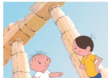
Frame from the animation.