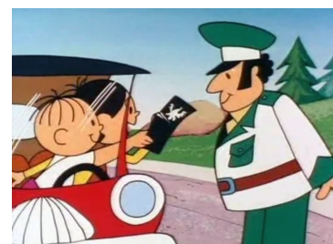
Frame from the animation.