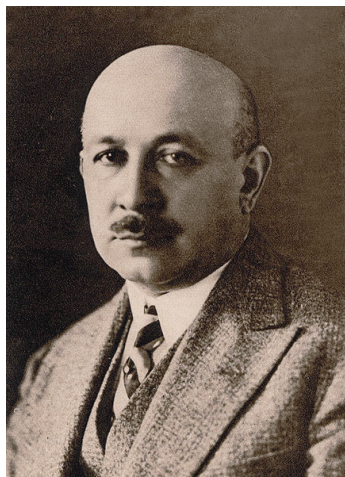
Kornel Makuszyński , portrait retrieved from Wikimedia Commons (accessed: June 27, 2018).