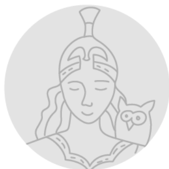
Carolyn Hennesy , b. 1962 (Author)