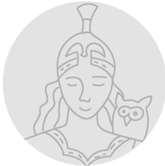
Weng Chen (Jade) (Illustrator)