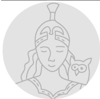
Weng Chen (Jade) (Illustrator)