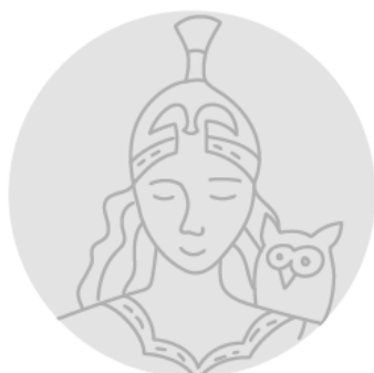
Carolyn Hennesy , b. 1962 (Author)