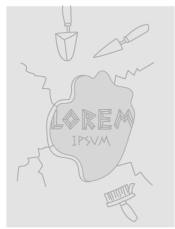
We are still trying to obtain permission for posting the original cover.