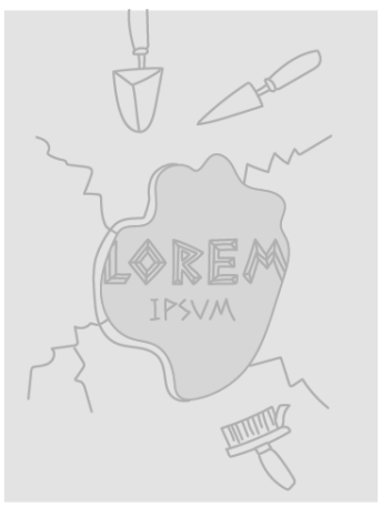
We are still trying to obtain permission for posting the original cover.