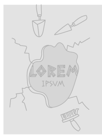
We are still trying to obtain permission for posting the original cover.