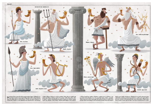
Greek Gods spread, illustration by Piotr Socha.