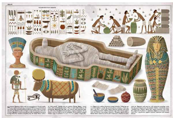
The ancient Egypt spread, illustration by Piotr Socha.

Interview with Agnes Monod-Gayraud , a translator of "Pszczoły" (into English) at Polskie Radio YouTube channel (accessed: February 18, 2018).