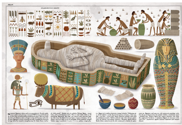
The ancient Egypt spread, illustration by Piotr Socha. Courtesy of the publisher.

Interview with Agnes Monod-Gayraud , a translator of "Pszczoły" (into English) at Polskie Radio YouTube channel (accessed: February 18, 2018).