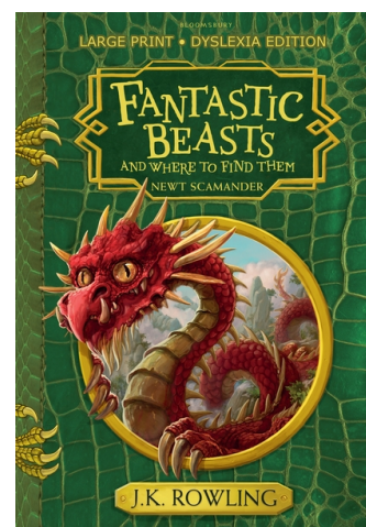
Covers from 2001, 2009, 2017 editions.