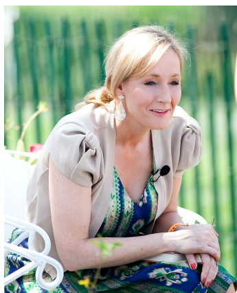
Portrait of J. K. Rowling