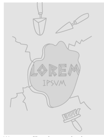
We are still trying to obtain permission for posting the original cover.