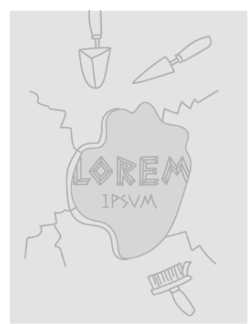
We are still trying to obtain permission for posting the original cover.