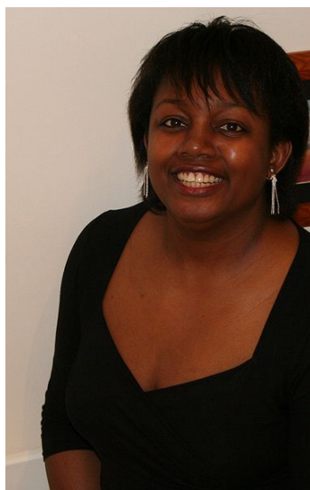
Malorie Blackman , b. 1962 (Author)

Malorie Blackman is an award-winning author of over 70 books for children and young adults, including Pig-Heart Boy , the Noughts & Crosses series and the Betsey Biggalow series. She also writes for stage and television, and many of her works have been adapted. Honours for Blackman and her work include the Eleanor Farjeon Award (2005) and an OBE for services to children's literature (2008). Blackman was the UK Children's Laureate from 2013-2015, the first Black British writer to hold this position. In late 2019 she announced her forthcoming autobiography, to be published by Stormzy's Merky Books in 2022.