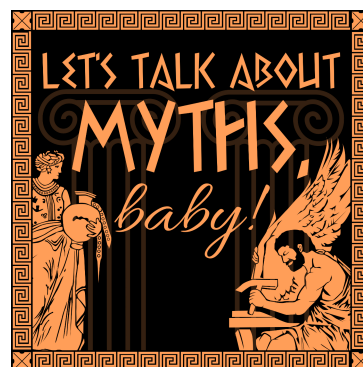
The podcast's logo