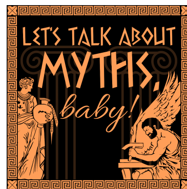
The podcast's logo

TAGS: Hero(es) Heroine(s) Homer Monsters Olympians Theogony